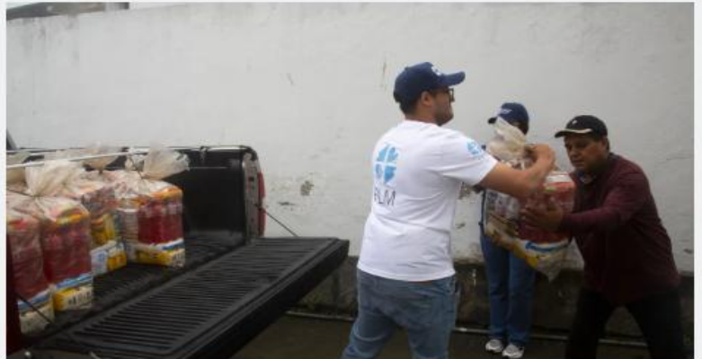
An LWF staff distributing a package of emergency relief items in El Junquito, Venezuela.

Church in Venezuela (IELV) offered these words of comfort during an online prayer of solidarity organized by The Lutheran World Federation (LWF) on 30 June, following two consecutive earthquakes on 24 June.