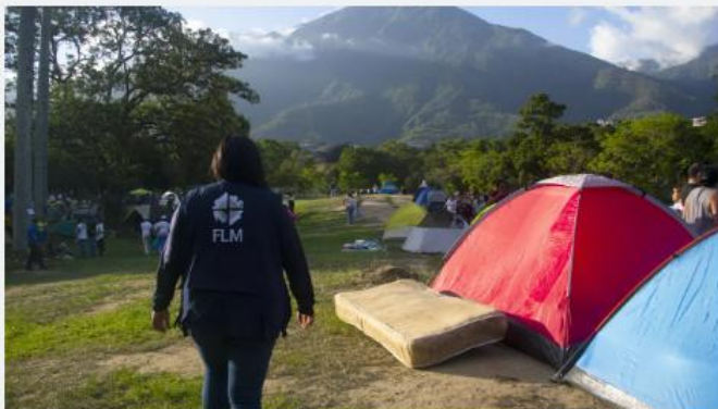
LWF staff conducting needs’ assessments in El Junquito, Venezuela.