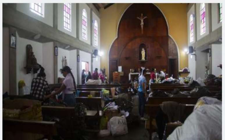
One of the locations visited was the collection and distribution center at El Junquito Church, where donations for the affected communities are received, sorted, and distributed.

His reflection put into words the experience shared by millions of Venezuelans. The loss is not only material: for countless families, it is also the loss of mothers, fathers, children, friends, and entire communities. It is a mix of feelings where pain and hope coexist, while a people renowned for their strength and resilience find encouragement in the solidarity received and in the stories of survival and miracles that continue to emerge amidst the rescue and reconstruction efforts.