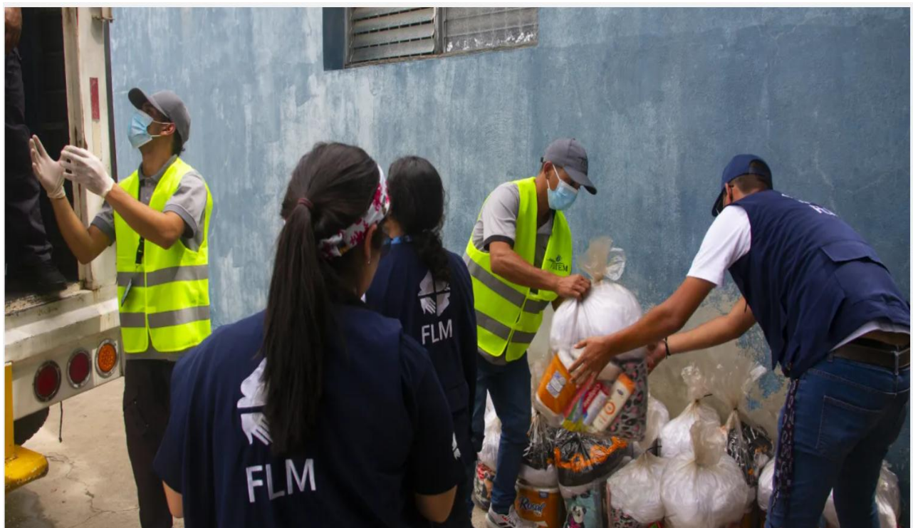
Working with local partners including churches, LWF staff put together relief kits for distribution in shelters at the Caribbean Maritime University, Catia La Mar, in La Guaira, Venezuela, on 30 June.

(LWI) - In the wake of the devastating earthquakes that struck northern Venezuela last week, The Lutheran World Federation (LWF) has launched an emergency response. Local teams are already on the ground, delivering life-saving aid to traumatized communities, as humanitarian needs grow exponentially by the hour. Working swiftly through local partners and the ACT Alliance, LWF has navigated logistical hurdles to distribute emergency assistance, conduct rapid needs assessments, and coordinate relief in some of the worst affected areas. Aid is reaching communities, but shelter, sanitation and food supplies remain critical.