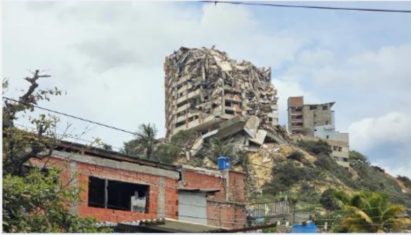
Many buildings were damaged or completely destroyed following the earthquakes. Here, buildings in La Guaira, Venezuela.